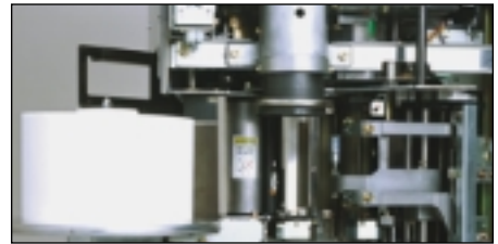
table coin wrappers / counters.

The critical elements of a wrapper's durability are alignment, center control and frame design. Glory has developed a unified frame to reduce distortion and maximize durability. The performance of the WR-400 and WR-80 will outlast compa-