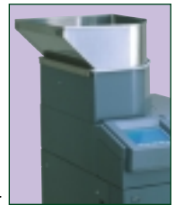
Optional extra large hopper

Optional extra large hoppers, printer, coin roll holder, material detector, remote control and large paper roll stands are available for casinos, armored couriers, and other