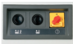
The automatic clamp control allows clamp to be moved up or down, independent of blade.