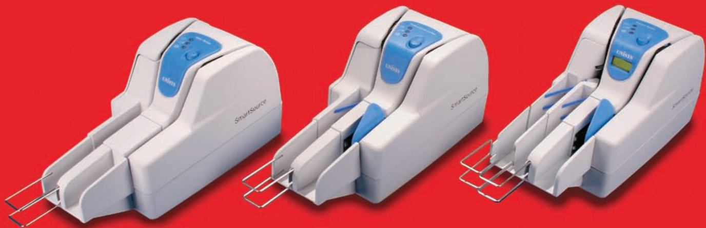
SmartSource Value series